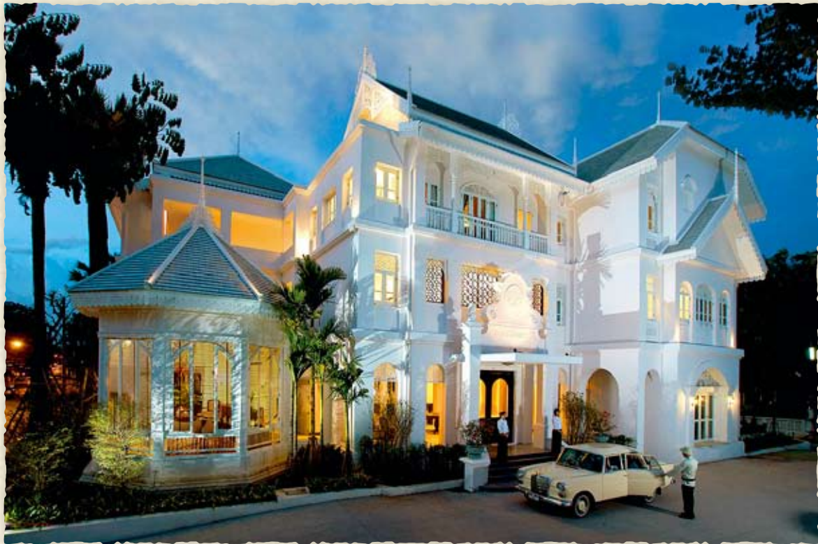
Ping Nakara is located on Charoenprathet Road – formerly the center of the golden teakwood industry in the area. The structure is designed and built in a Lanna colonial style, using old Chiang Mai merchants' houses as a model.