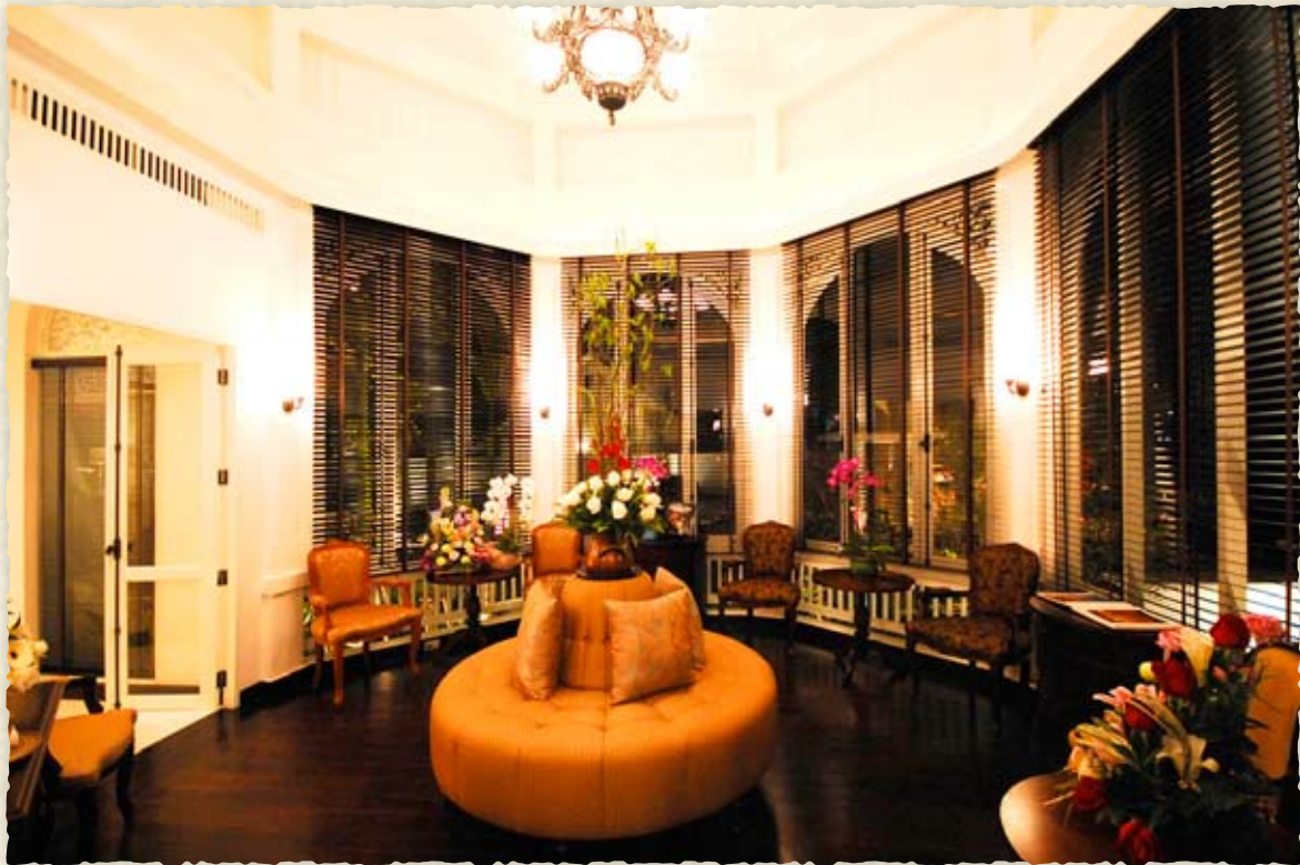
The Rotunda—This octagonal shaped hall is used as a place for waiting guests or relaxing with books from the library.