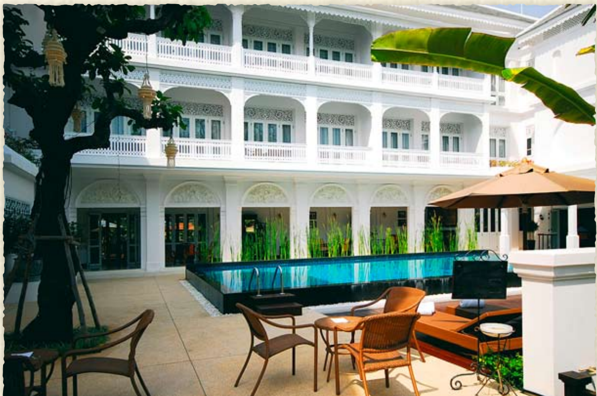
The rectangular infinity swimming pool offers a private and comfortable area to relax with food and beverage services. On the right side of the pool is the hotel restaurant. Parallel to the pool is the Colonial-style veranda. The hallway is decorated with 16 bas-relief stucco plaques telling the story of the forest industry.