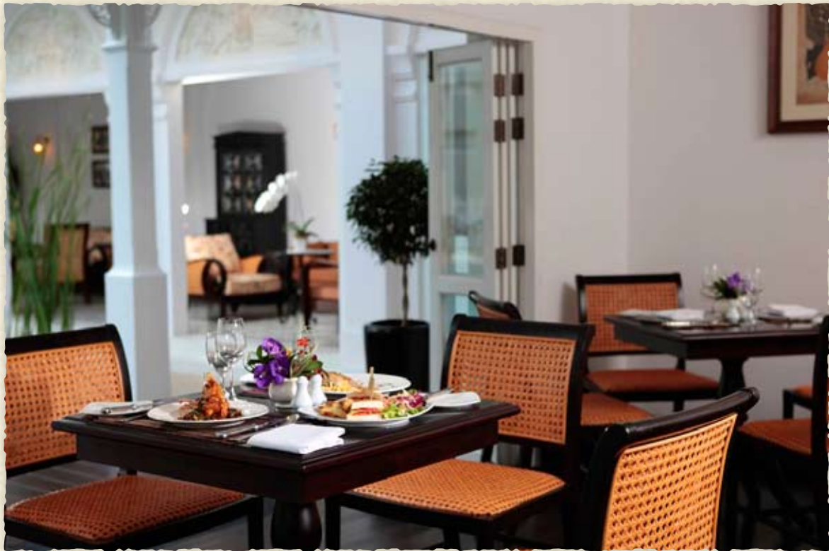
The small dining room is furnished with rattan-wood furniture and offers guests a vintage feeling. Swimming pool can be seen from here.