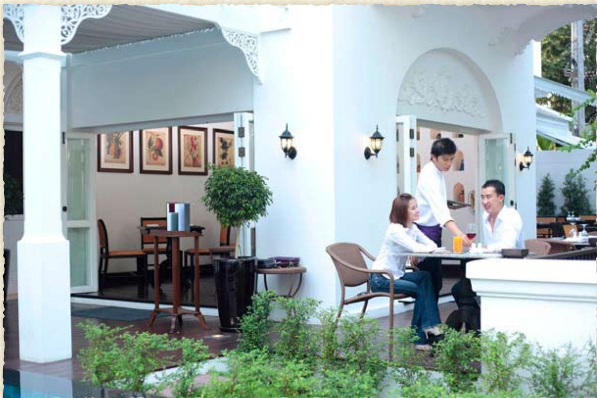
Tranquil, pleasant, and shady dining area with art and decorative details all around.