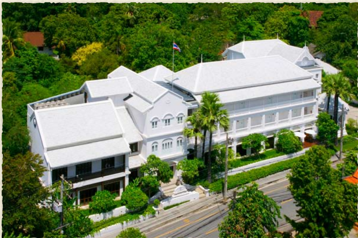
'Ping Nakara' combines 7 structures, each with a distinctive architectural or decorative style, but all working harmoniously together to offer guests elegance and exquisite impression of times past.