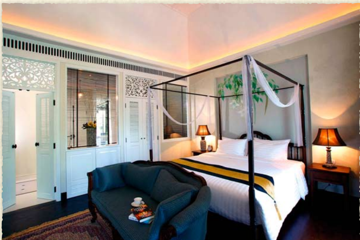
Grand Deluxe Room—The walls of the room are painted in light green, while sponge technique is applied to add dimension to the surface of the wall. The room is decorated with a painting of a cork tree, from which the room takes its name.