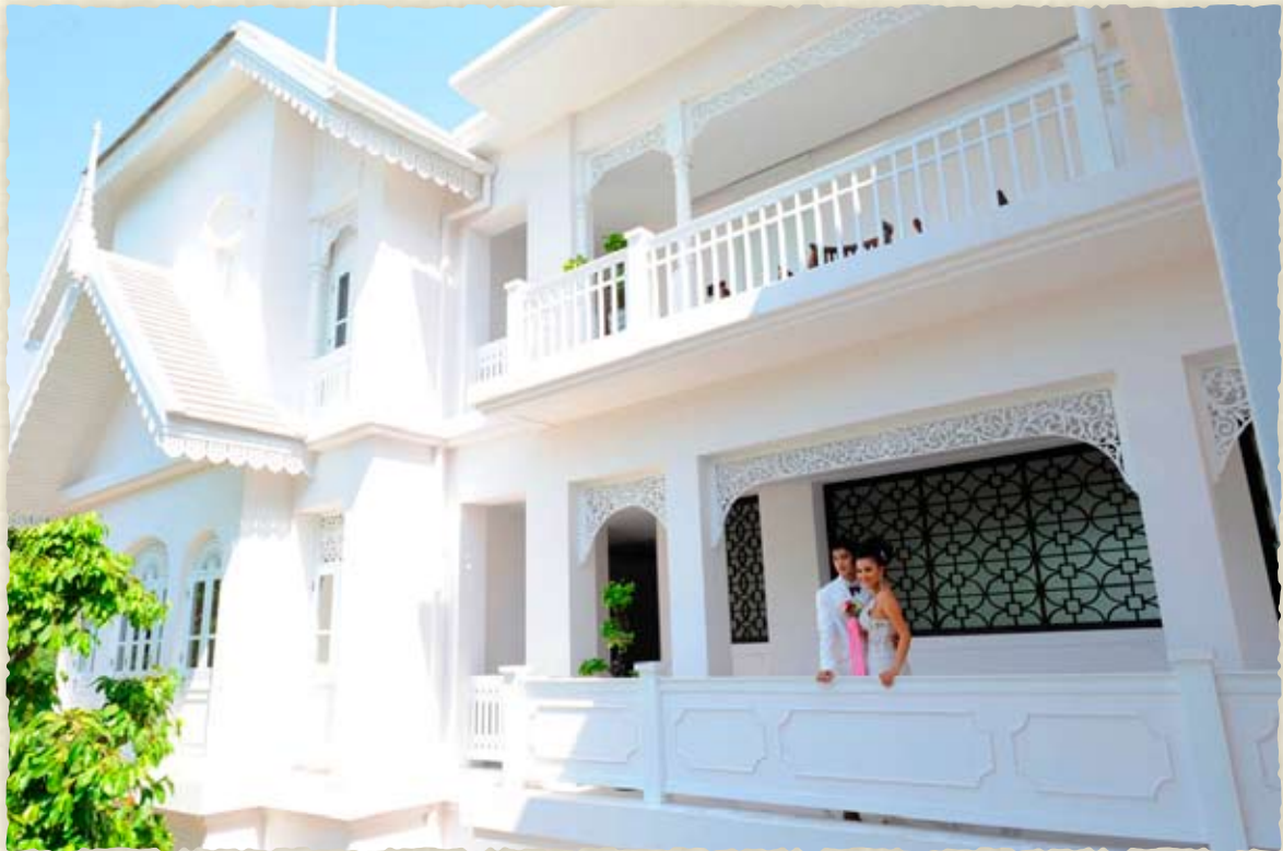
At the side of the hotel facing the swimming pool, the details of the building cast shadows on its own white structure producing diverse patterns that change throughout the day—a spot favored by newly-weds.