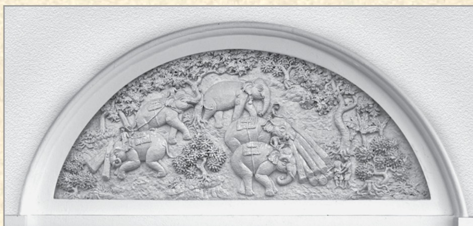
14. Elephants carrying the logs