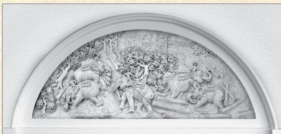
16. Pulling plenty of logs from the Ping River