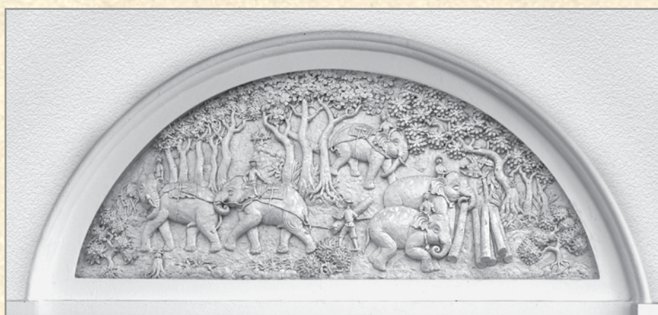
12. Pulling logs from the teak forest