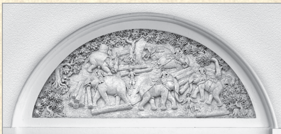
15. Towing logs into the Ping River