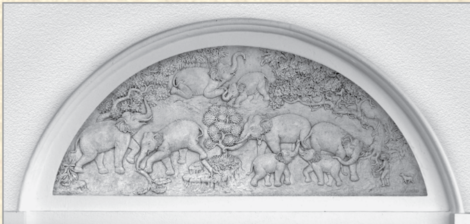
7. Elephant's family