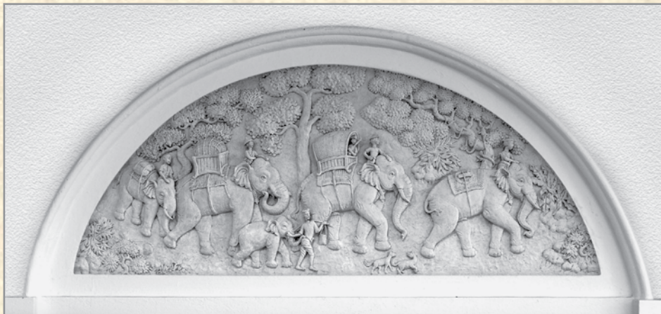
3. Marching to the forest