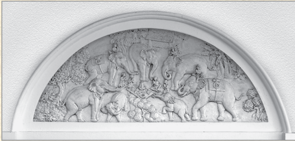
1. Spiritual ceremony for the elephants