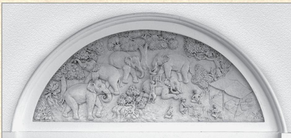
4. Camping in the forest