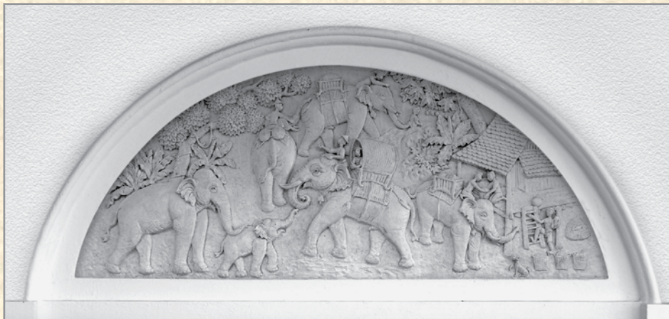
2. Preparation before entering the forest