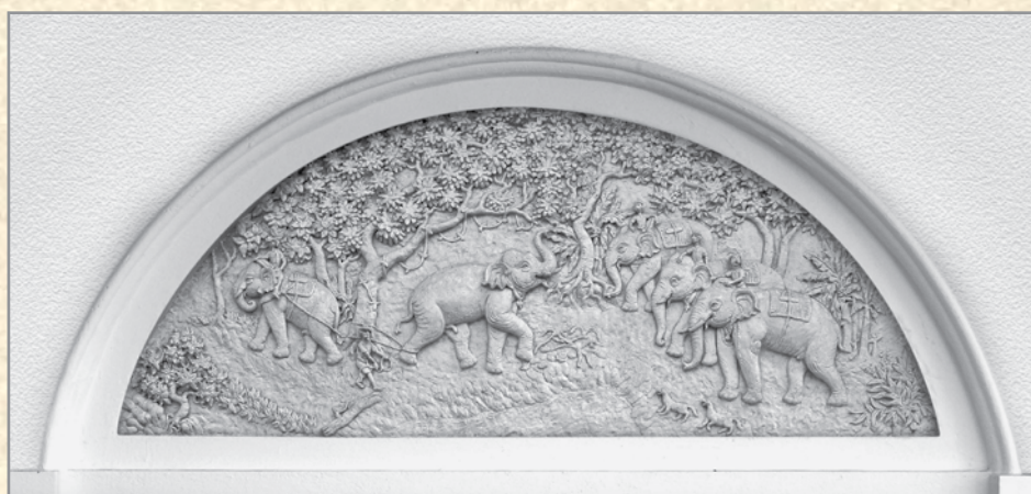
10. Calming the temperamental elephants