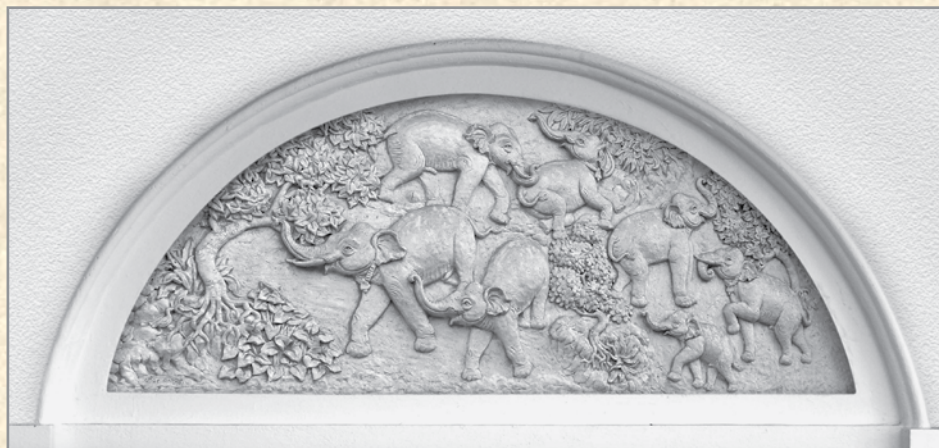
9. Mating of wild elephants and working elephants