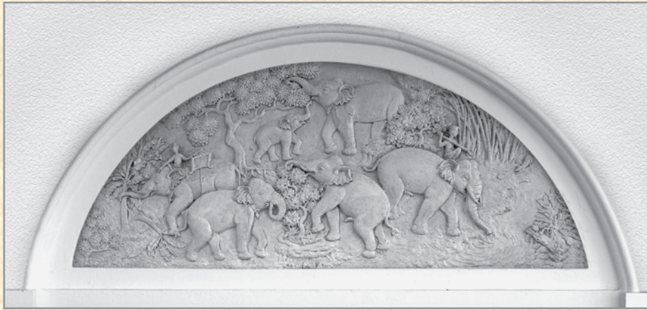
5. Seeking for food