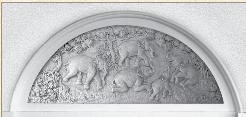
8. Relationship between mahouts and elephants