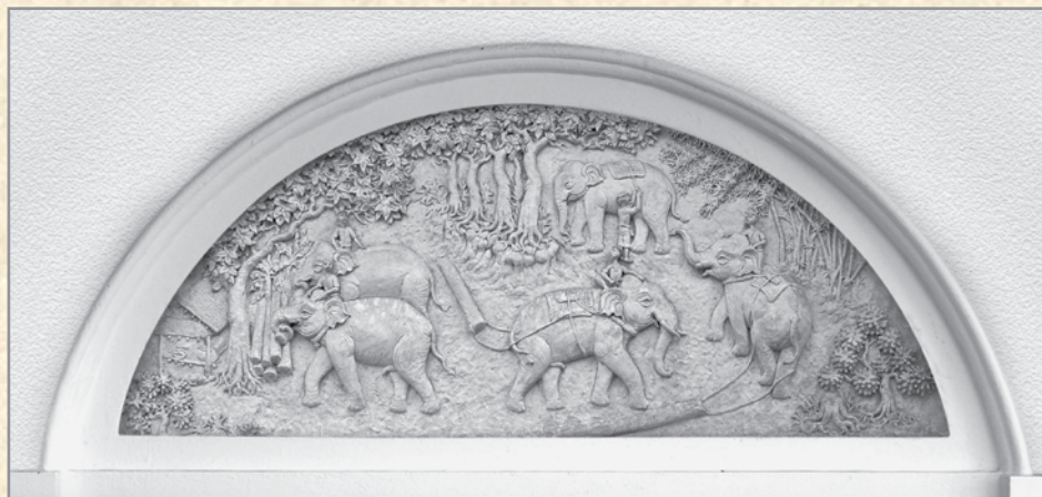
13. Pulling and lining up the log into the camp