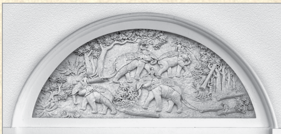
11. Cutting logs to be pulled by the elephants